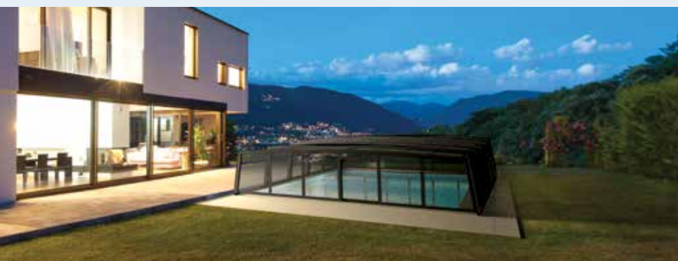
PRINCIPLE OF THE FRAMEWORK COVER